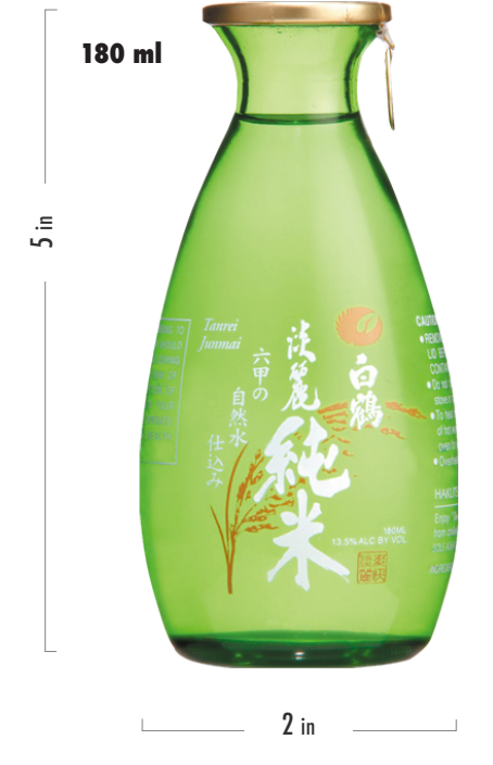
180ml 5 in x 2 in